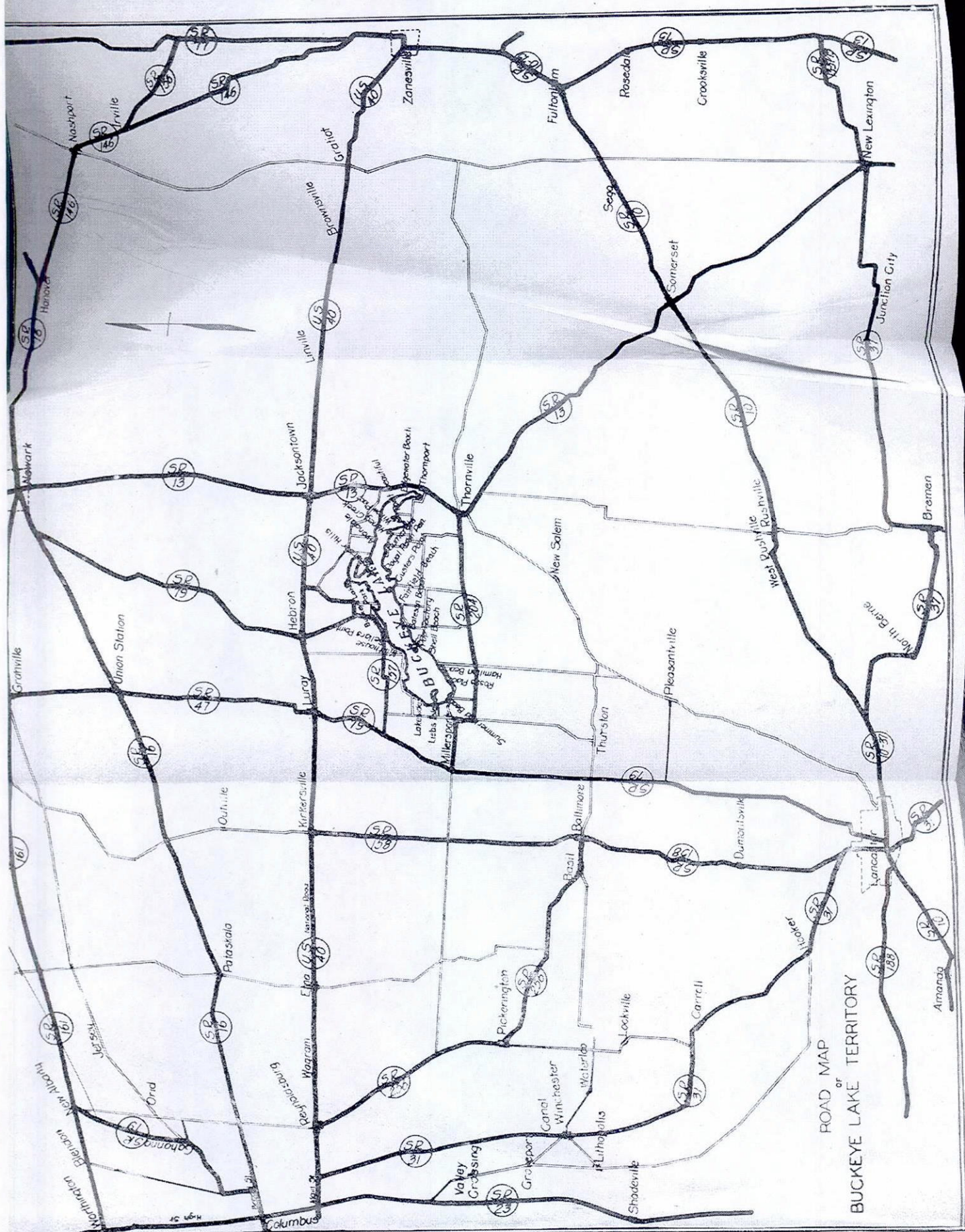
ROAD MAP OF BUCKEYE LAKE TERRITORY